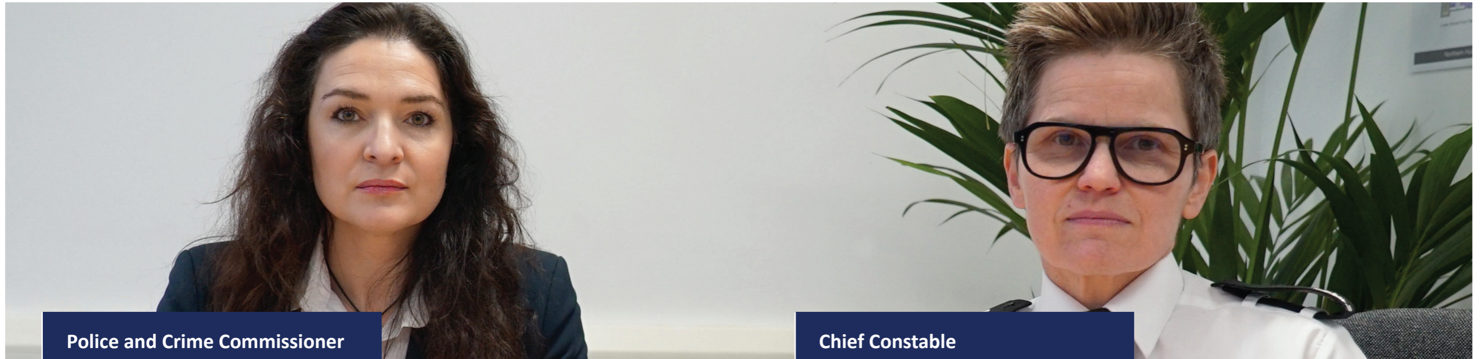
Police and Crime Commissioner

Government and there is the possibility for new, or re-defined, responsibilities being given to us over the course of this Police and Crime Plan. I will be working closely with my team, and fellow Police and Crime Commissioners to understand what these new responsibilities include and how we will deliver against them.